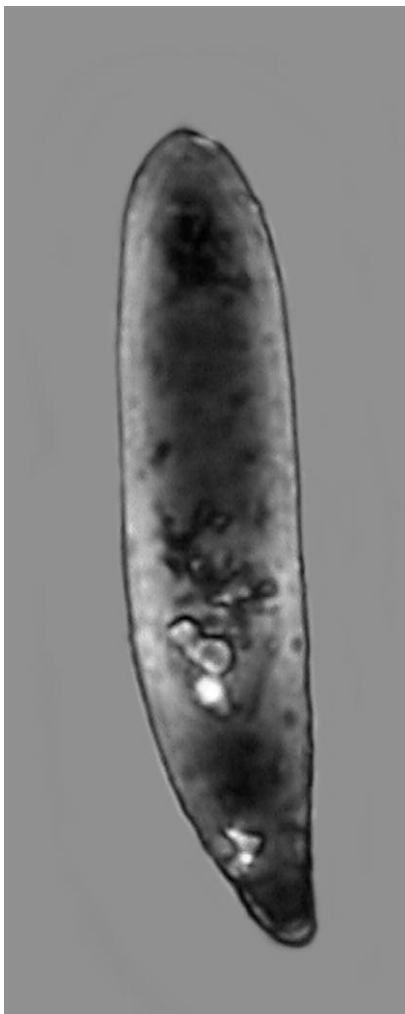
Fig. 1. Demodex ratticola , egg

Although, individual species of demodectic mites are listed in different textbooks on diseases and parasites of rats, actual and documented records are missing in the related literature. Nevertheless, despite the lack of available data on the occurrence of synhospital Demodex spp. in brown rats from