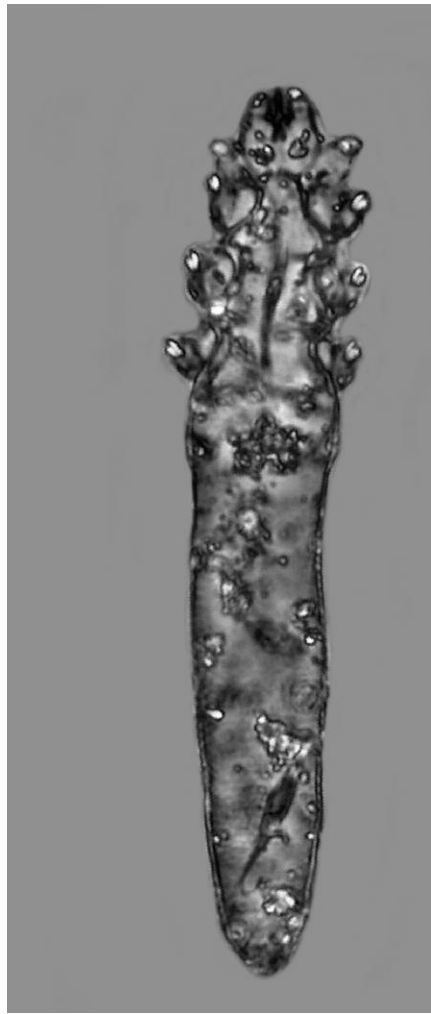
Fig. 2. Demodex ratticola , male