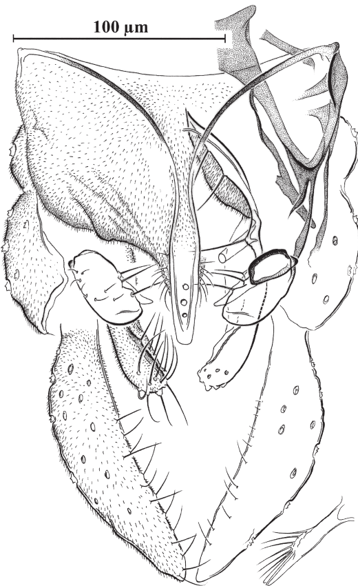
FIG. 1. Tanytarsus desertor new species, male. Hypopygium.

Etymology. So far, the species has succeeded in eluding the dipterologists' attention and thus deserves being called a deserter. The name is to be treated as a noun in apposition.