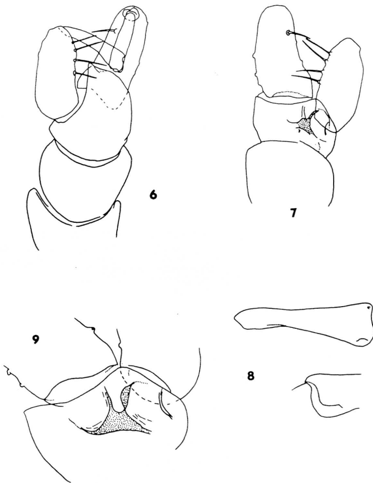
Figs 6-9. Corethrella miocaenica sp. n., male genitalia: 6 – laterodorsal aspect; 7 – lateroventral aspect; 8 – gonostyli; 9 – aedeagus.